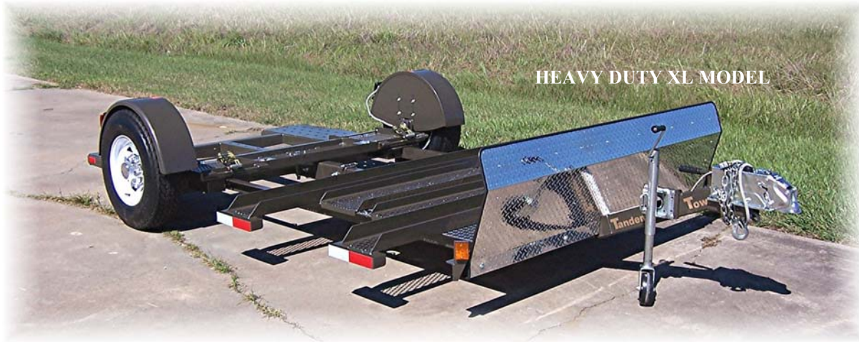
HEAVY DUTY XL MODEL

An alternative to towing a large enclosed trailer in order to transport your car and two motorcycles, golf cart, or ATV. Two riders...Two Bikes...One Tow Car...One RV!